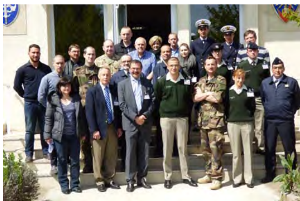
AASTP-1 and 5 Lecture Series held in Versailles, 24 to 28 April 2016

The fifth and last AASTP-1 and 5 lecture series of the year will follow 2-6 October in Kineton in the UK. This event is however already fully booked. Fortunately there are new chances in 2018! Canada and Belgium have requested the lecture series and discussions are currently going on with two other nations.